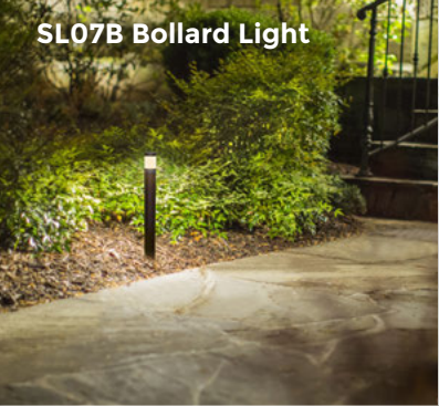
SL07B Bollard Light