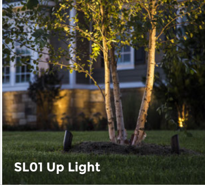
SL01 Up Light