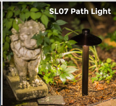
SL07 Path Light