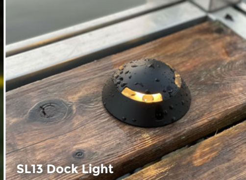
SL13 Dock Light