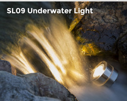
SL09 Underwater Light