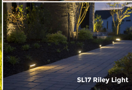
SL17 Riley Light

Since its founding in 2010, Sterling Lighting has been focused on creating innovative landscape lighting fixtures known for quality, performance, and reliability. The vision for the company was simple yet profound: Merge the latest advances in LED technology with premium quality components and all the cutting-edge features a professional contractor could want.