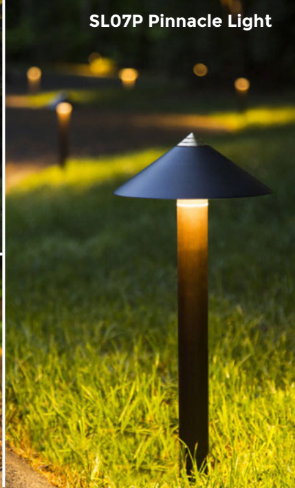
SL07P Pinnacle Light